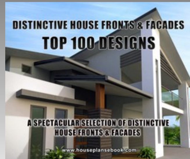
House Facades and Home Fronts details HERE