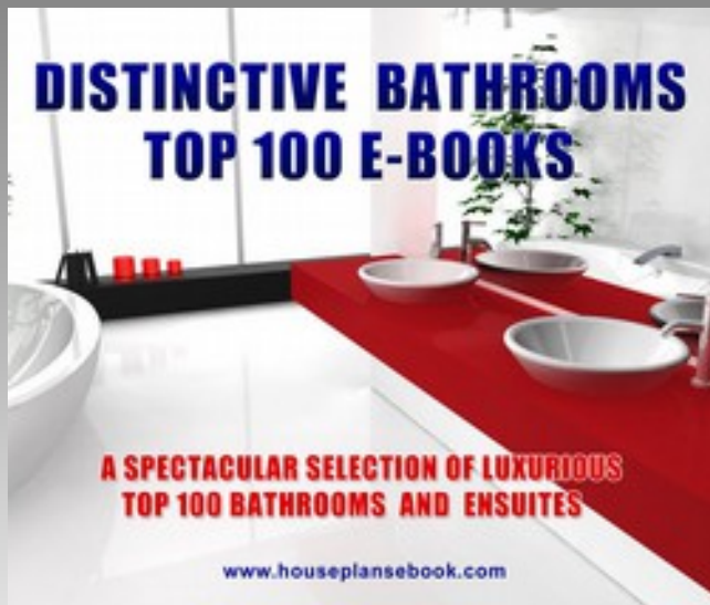
Bathrooms Ebook more details HERE