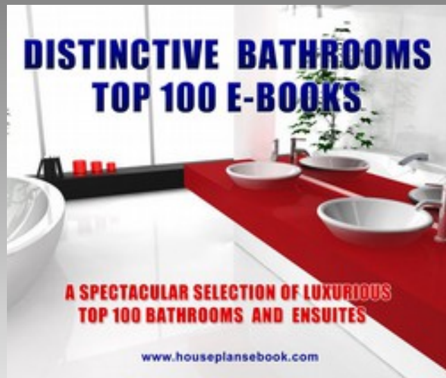
Bathrooms Ebook more details HERE