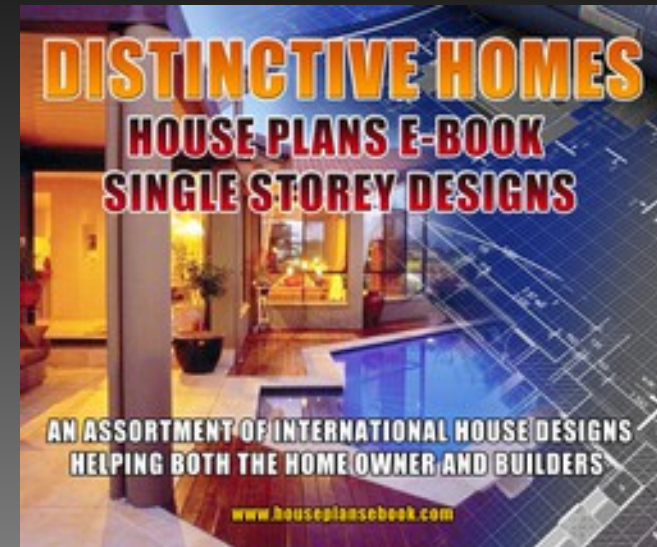
1 Storey Homes Ebook more details HERE