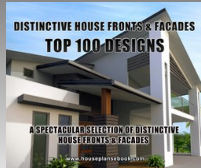
House Facades and Home Fronts details HERE