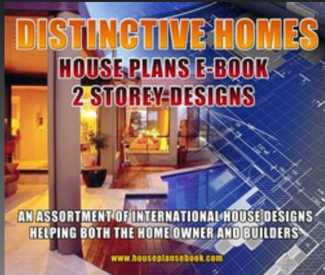
2 Storey Homes Ebook more details HERE